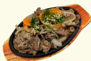
| Beef Bulgogi