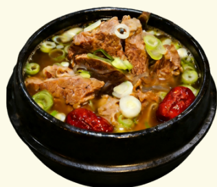
| Galbi Tang