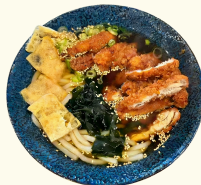
| Katsu Chicken Udon