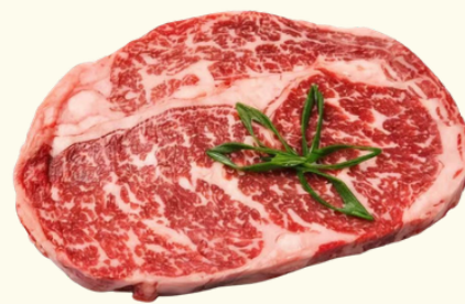
| Wagyu Ribeye