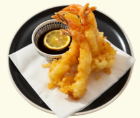
| Tempura Prawn