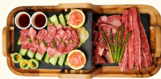
| Premium Beef Set