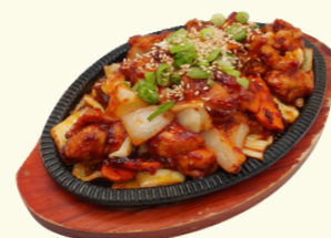
| Spicy Squid