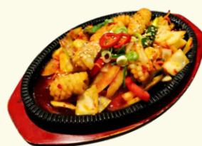
| Spicy Squid