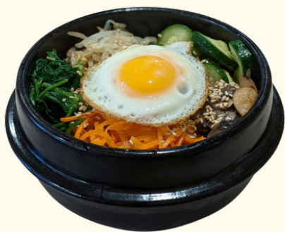
| Bibim Bap