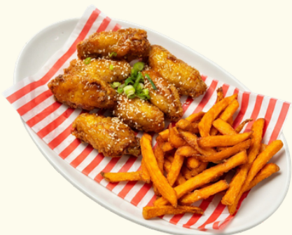
| YangNyeom Chicken