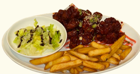
| Chi-Mc Set