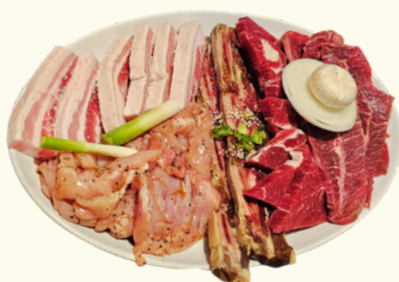
| BBQ Large Set