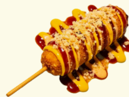
| Corn Dog