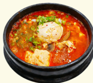
| Kimchi JGiGae