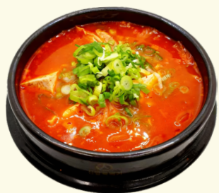
| Soon Dubu JGiGae