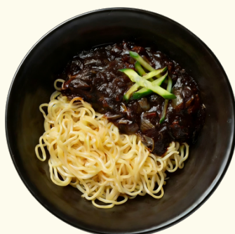
| JJaJang Myeon