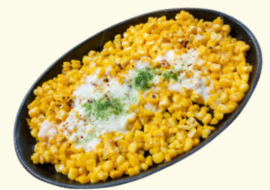
| Corn Cheese