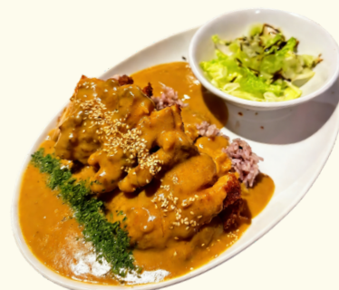
| Chicken Katsu Curry