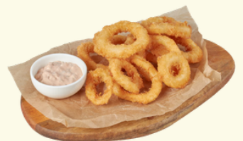
| Squid rings