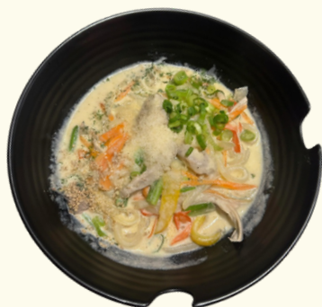
| Creamy Stir-fried Udon