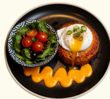
| Kimchi Fried Rice