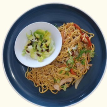
| Chicken Fried Noodles