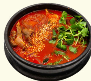
| Yook GaeJang