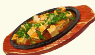
| Spicy Tofu