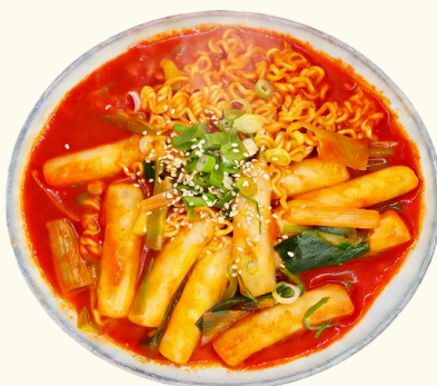
| Tteok Bokki